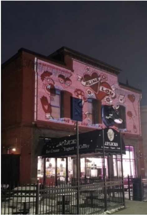
“Show Your Love” projection show, February 2021. Shown is a drawing submission by @GerrishMacLean for Alina and Lou.