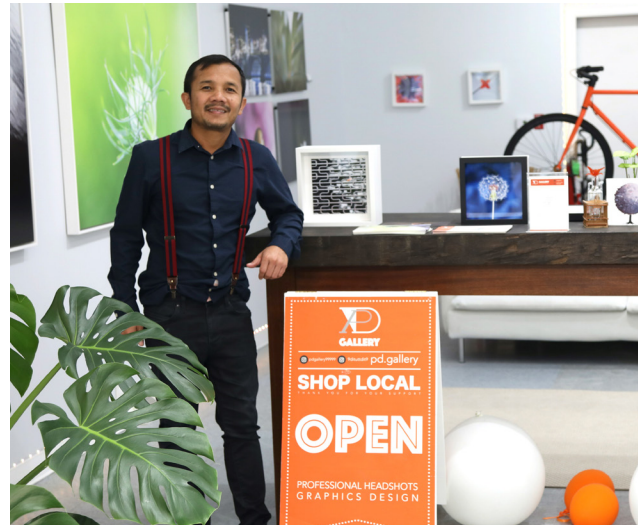
PD Gallery 606 Centre St. @pdgallery99999