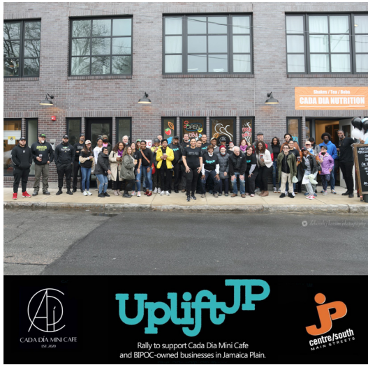
Photo from Cada Dia event on Sat., 19 March.

Sign up for our email newsletter to stay updated! Text JPCSMS to 22828 now.