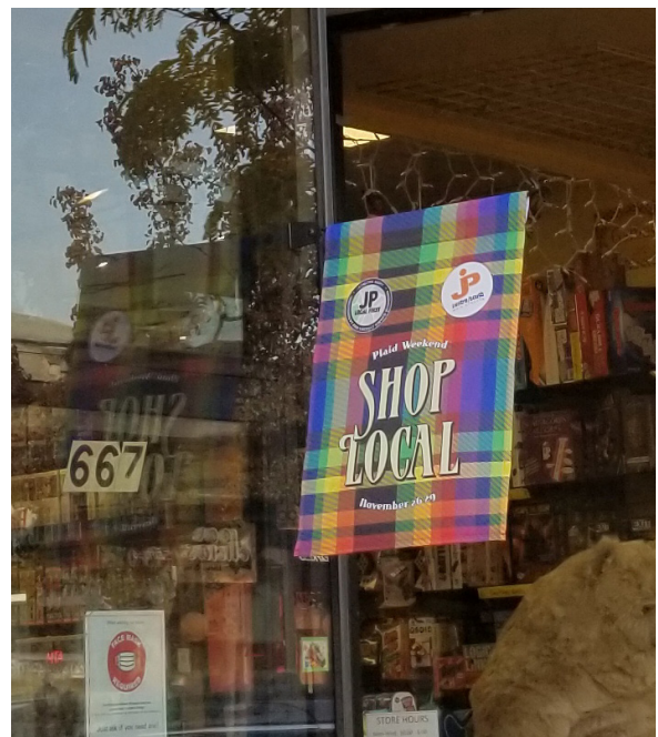
Businesses planned events to coincide with Small Business Saturday donated proceeds from the weekend to their favorite charity. Great partnership with JP Local First!