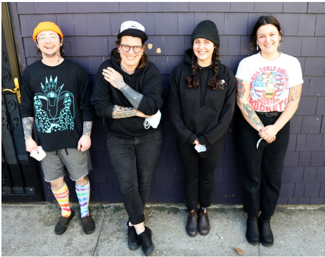
Said and Done Tattoo @saidanddonetattoo saidanddonetattoo.com