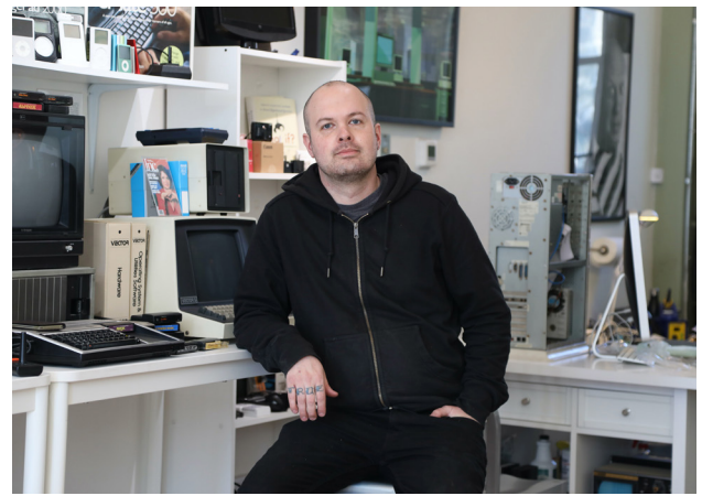
The BYTE Shop 48 South St. @byteshopjp