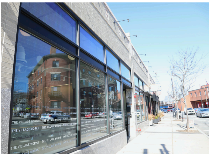
The Village Works 769 Centre St. @thevillageworks thevillageworks.com