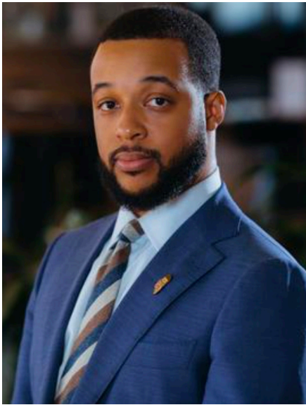
Chief Segun Idowu