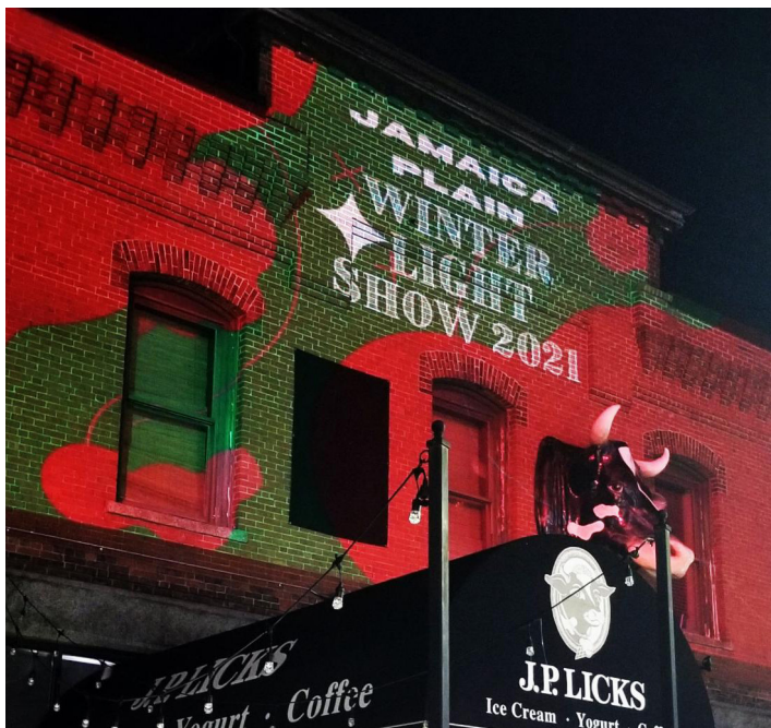
This year's Winter Light Show was projected onto the J.P. Licks Building, and ran from Dec 8, 2021, to Jan 9, 2022. The light show featured animations of our beloved JP Albin Squirrel and ice skating on Jamaica Pond.