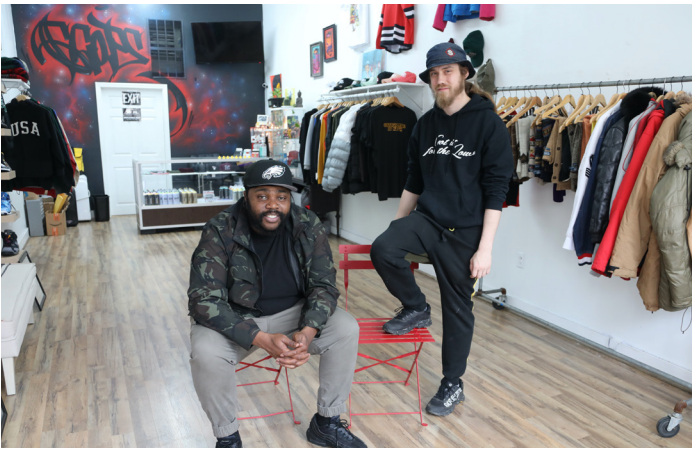
SCOPE HQ 484B Centre St @scopeapparel linktr.ee/ScopeApparel