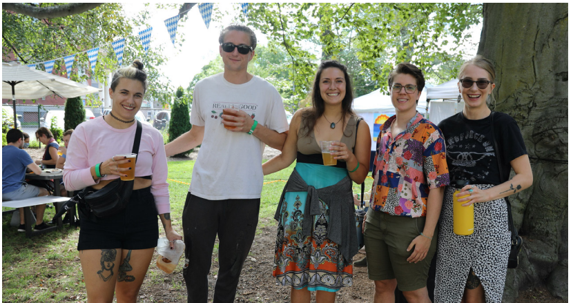
Attendees enjoy the Hive Events Beer Garden with beer from Roundhead Brewing, during the Canine Costume Parade and Cornhole Tournament Fundraiser. Over 1000 people attended the event at Loring Greenough House on October 31, 2021.