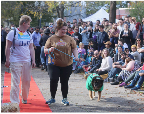
Pups and pup parents participate in the Annual Canine Costume Parade, on October 31, 2021, at the Loring Greenough House.