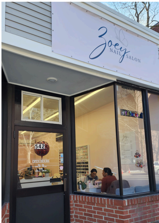
Zoey Nail Salon 542 Centre St March 2024