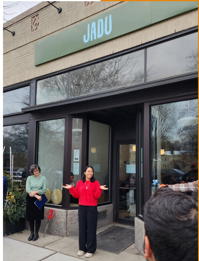
Jadu 767 Centre Street December 2024