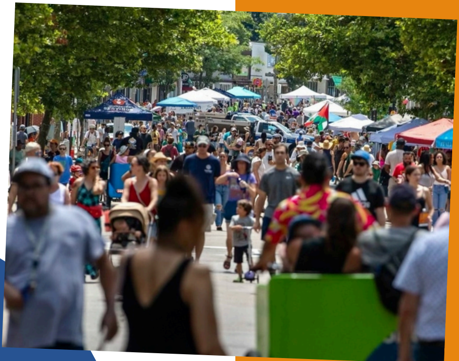
Open Streets Jamaica Plain, July 21, 2024

The city's Open Streets event is estimated to have brought over 15,000 people to Jamaica Plain.