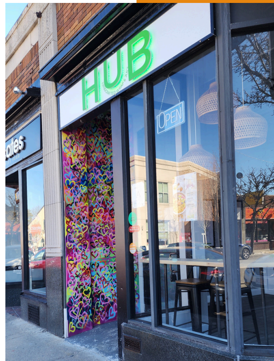
The Hub 660a Centre St March 2024