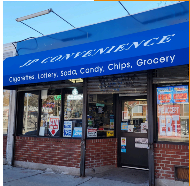
JP Convenience 546 Centre St March 2024