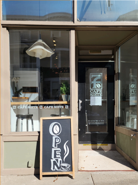
Cafe Siete 7 Pond Street May 2024