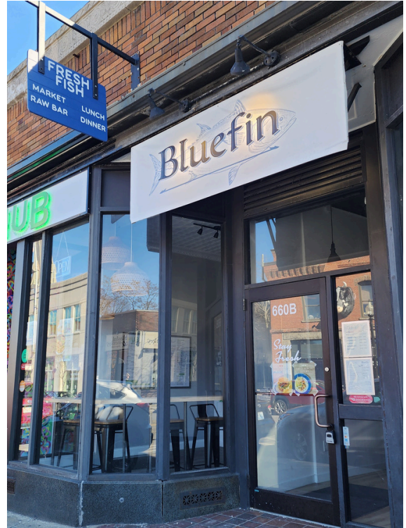
Bluefin Raw Bar 660b Centre St May 2024