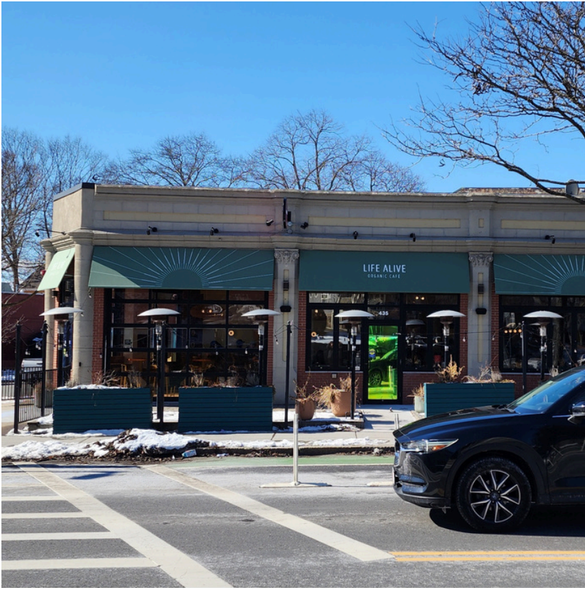
Life Alive 435 S. Huntington October 2024