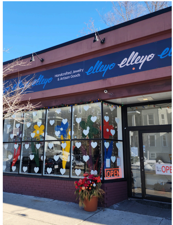
Elleyo 146a South Street October 2024