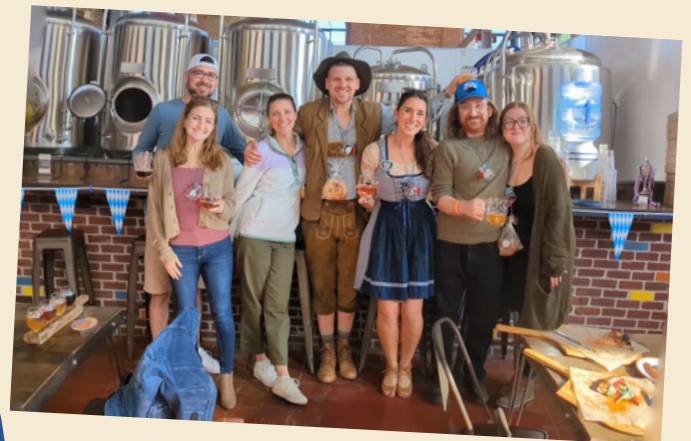
Volunteers led attendees on the Main Streets Pub & Brew Trolley Tour. October 6, 2024.