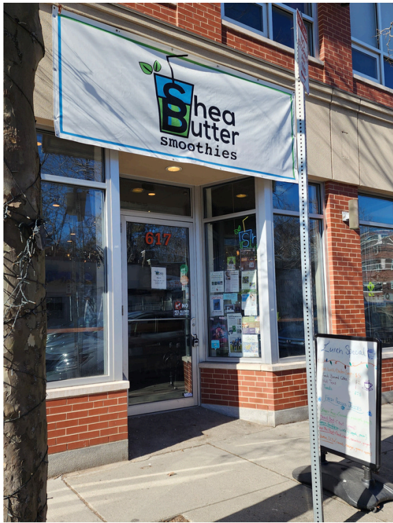
Shea Butter Smoothies 617 Centre Street January 2024